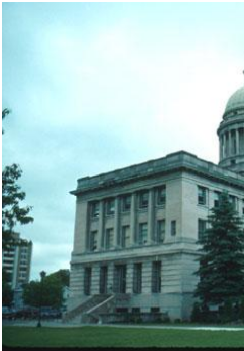
Cortland County Court House

http://upload.wikimedia.org/wikipedia/commons/a/ac/Cortland County Courthouse (Built 1922-1923), Cortland, New York.jpg