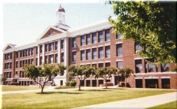
The Old Jr. Sr. High School

There has been a public high school in Cortland since the mid-1800's. The first high school was in downtown Cortland. The present high school is on a hill on the edge of town. The present high school was first built in 1965 and has been changed throughout the years. At first, the junior high and grade 9 stayed in the old building downtown, and the new high school had only grades 10, 11, and 12. In 1965, the new building consisted of two sections. One had the auditorium, cafeteria, and a gymnasium, and the other section had classrooms. Over the years, everything changed. The junior high was added to the new building along with new administration and guidance offices, computers labs, and new music, art, and science wings.