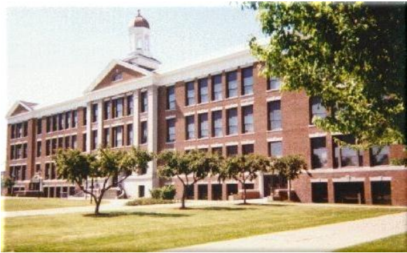
The Old Jr. Sr. High School

There has been a public high school in Cortland since the mid-1800's. The present high school was first built in 1965 and has been changed throughout the years.