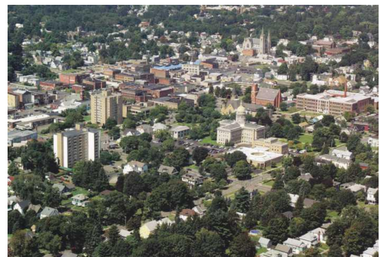
View of Cortland from the Air