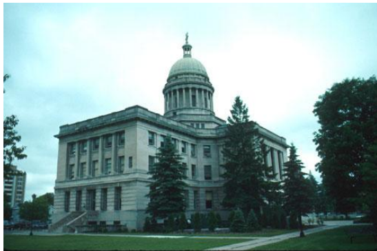
Cortland County Court House http://upload.wikimedia.org/wikipedia/commons/a/ac/Cortland_County_Courthouse_(Built_1922-1923),_Cortland,_New_York.jpg