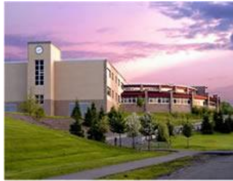
The Current Jr Sr High School (Rear Entrance)