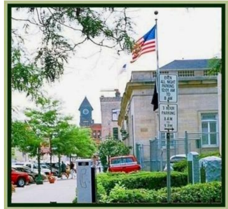
Part of Main Street in recent years (looking south) http://www.city-data.com/picfilesv/picv10764.php